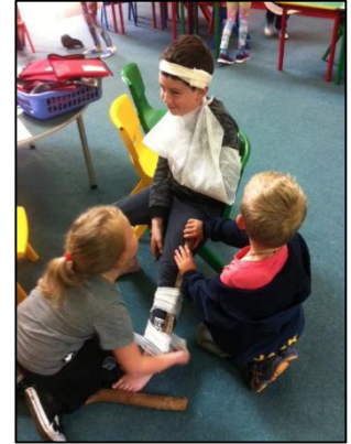
first aid – part of bushcraft